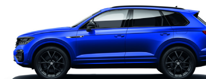
Lapiz Blue Metallic* 3