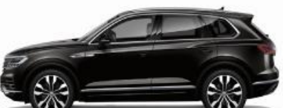
Grenadilla Black Metallic*