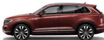
Malbec Red Metallic*