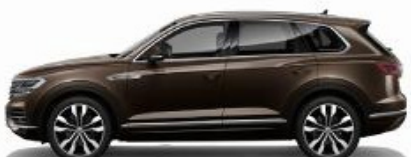
Tamarind Brown Metallic*