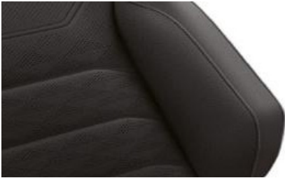
"Savona" leather Soul (VM) Optional on Elegance & Elegance PHEV

Note: WLA is only available with interior code VM Please note, the print processes do not allow exact reproduction of the upholstery colours.