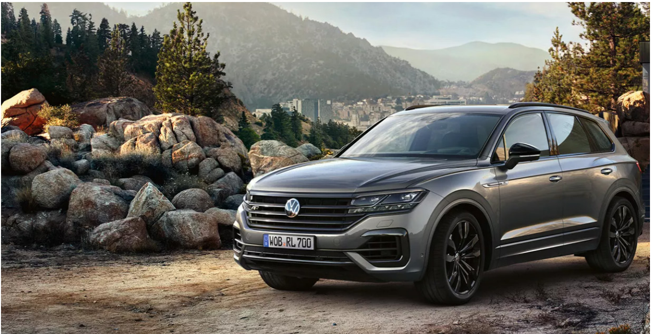
Note: The above image shows optional 21" 'Suzuka' alloy wheels in black

For exact options prices for your vehicle, please contact your local dealer or visit www.volkswagen.ie