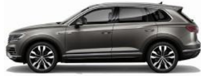
Quartzite Grey Metallic*