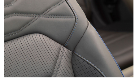
"Puglia" leather Soul (OF) Standard on R Model