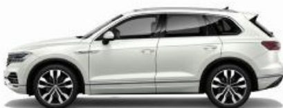
Oryx White Pearl Effect*