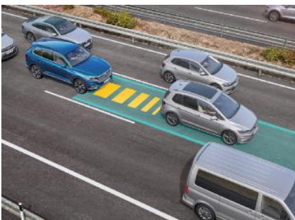
*Within the Limits of the System

For this purpose, two radar sensors are integrated in the front bumper, which sense at a 55 degree angle to the vehicle's longitudinal axis to monitor side traffic. Here too, the system intervenes with emergency braking actions*.