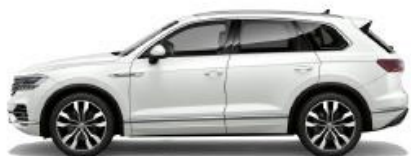
Pure White Solid